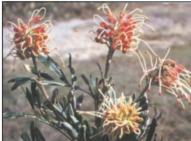
G. banksii Colour variant, Agnes Waters Headland

Further, a very low incidence of pink forms (only 5 or 6 plants) was also recorded in the wild in the very extensive populations of tall trees (up to 5-10 m), otherwise red flowering, in 1994 north of Byfield (Bryson Easton pers comm).